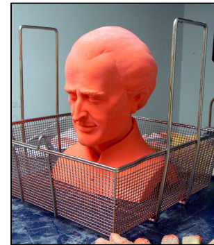
SLS® Part After Waxing

Since this was to be a master pattern for metal casting, APP chose to use the SLS® process and 3D Systems CastForm™ PS powder to build each segment. CastForm™ powder, with its low density and low ash content, was formulated specifically for the investment casting process and is a favorite among foundries across the country. The 3D Systems Sinterstation® HiQ™ HS was the machine selected for this project. The HiQ HS has a large build envelope of 15x13x18+ and a high-powered laser to facilitate faster builds. Eight builds were scheduled to complete the 28 segments that made up the complete statue which would take approximately eleven days of machine time to complete. Each build, holding 3 to 5 segments required an average of 32 hours each. After each build was finished, the parts were required to cool in the machine for several hours before part removal could begin. Once the parts had cooled, they were carefully removed from the bed of powder and cleaned off to remove excess powder with brushes and delicate tools. Once each piece was completely free of excess powder, it was hand dipped into hot, melted foundry wax for a specific amount of time which was dependent on each segment's thickness. The part was then removed and allowed to drain and cool. After additional hand work, the segments were complete and ready to be packaged and sent to the foundry.