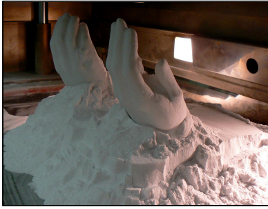
Hands and Arms in the SLS® Machine

Graham had utilized additive fabrication, specifically SLS®, SLA® and Polyjet in the past for smaller statues and wall panels that required no secondary finishing or processes. However, this project was unique because the piece was exceptionally large and had to be cast in bronze. This statue, with its intricate detail and size was a challenge not only for APP but also for Graham. All parties involved were on a tight schedule which left no room for error in any phase of the project.