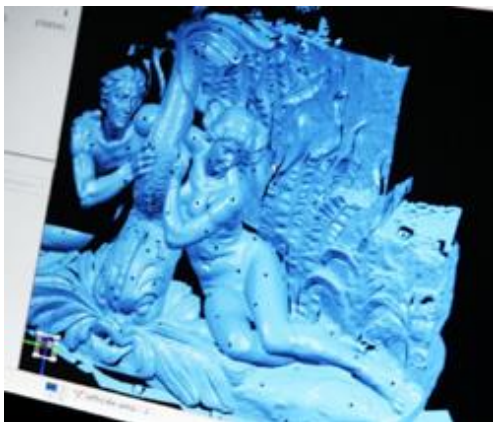
The scanned image begins to take shape.

Once the model is perfected, Blatern will begin using the old-fashioned pointing method to carve four large blanks of stone into something close to the original. At some point, when the levels of noise, dust and accuracy are deemed appropriate for public display, the partially carved stones will be moved to the courthouse lawn, out in front of the existing sculpture, where the work will be finished.