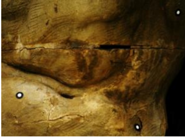
The male nymph's abdomen from The Spirit of the Ocean shows the registry dots, the seam between two sandstone blocks and evidence of surface decay.