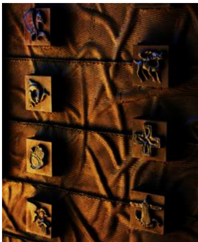
Scansite also performed the scans for the highly detailed bronze doorways of Our Lady of the Angels in Los Angeles.

Scanning a 747, it turns out, is easier than scanning a sculpture the size of a Hummer, such as The Spirit of the Ocean. The registry dots they stick to the 747’s fuselage have more information on them, allowing a special camera to snap away quickly. The scanner is then run over much larger areas; the software uses the camera registry dots to line up the scanned image.