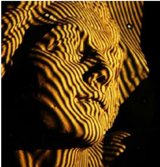
The bands of light are read by the scanning device to establish points in space.

The next big step in the replacement process was to obtain a three-dimensional scan of the existing sculpture, and Federici and Bassett were in town to complete that step.